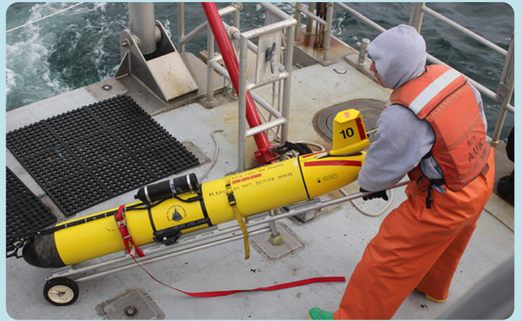
A researcher gets ready to launch an underwater vehicle called a "glider." The glider records all sounds as it follows a programmed path.