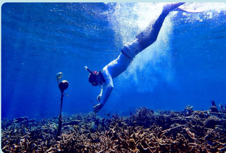
A hydrophone is deployed on a tropical reef where restoration began three years previously in Indonesia.