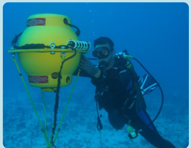
A biologist checks on one of the Marine Autonomous Recording Units (MARUs).