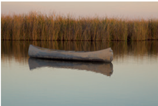
The Last Stand of the Colorado River Delta Wetlands

This hefty bird does not appear flight-ready, yet a mallard can fly at 55 mph for many hours on stiff, rapidly beating wings. Mallards have adapted well to human incursions, but many species of waterfowl cannot make the transition and their numbers are declining year after year. Habitat loss is the problem as bogs, estuaries, and prairie potholes are converted to farms and subdivisions.