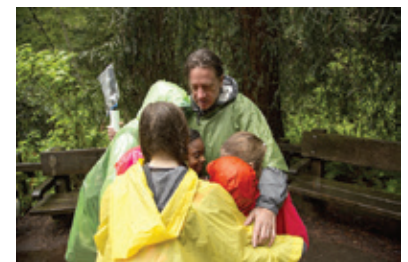
BioBlitz 2014, Golden Gate National Parks, California.

Students from all over the country attended National Park Service/National Geographic BioBlitz events in 2013 and 2014. Together, they developed a sense of awe about the natural world as they worked together with volunteer scientists, teachers, and other community members to find and identify as many species of plants, animals, microbes, fungi, and other organisms as possible within the 24-hour event.