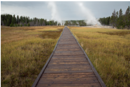
Path to Yellowstone

Often called the American Serengeti, Yellowstone is the last place in the United States where a visitor can observe the full cast of keystone species playing their roles in the quest for survival and reproduction. Everyone is here; grizzly and black bears, bison, grey wolf, deer, elk, moose, pronghorn, eagle, osprey, cutthroat trout, and thousands of other supporting species, all discoverable to those who take the time to go and look.