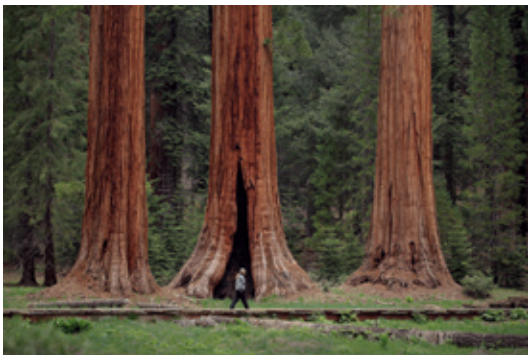
Three Sequoias and a Primate in Sequoia National Park

Since the completion of the Hoover dam in the 1930s, the Colorado River has not reached the Sea of Cortez, just below the U.S. border. Once forming a truly epic delta, now there is but a remnant of its former grandeur in this small “cienega.” It relies on runoff from the thousands of acres of farmland surrounding it. Still, there is hope. Groups like the Sonoran Institute are finding ways to buy water rights and restore the seasonal flow. The first big pulse in fifty years reached this area in 2014.