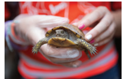
BioBlitz 2013, Jean Lafitte National Historical Park and Preserve, Louisiana.