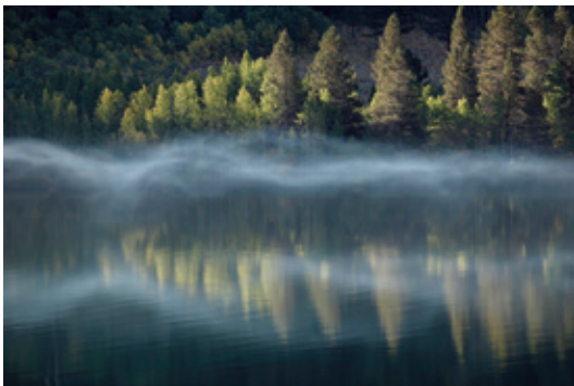
Gull Lake with Fog

Often called the American Serengeti, Yellowstone is the last place in the United States where a visitor can observe the full cast of keystone species playing their roles in the quest for survival and reproduction. Everyone is here; grizzly and black bears, bison, grey wolf, deer, elk, moose, pronghorn, eagle, osprey, cutthroat trout, and thousands of other supporting species, all discoverable to those who take the time to go and look.